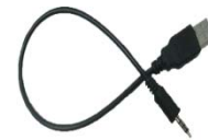
1 x USB Cable