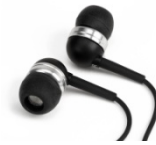
1 x Headphones