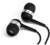
In ear earphones