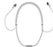
Around neck earphones