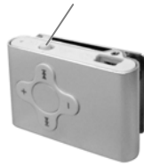
Power ON/OFF Switch